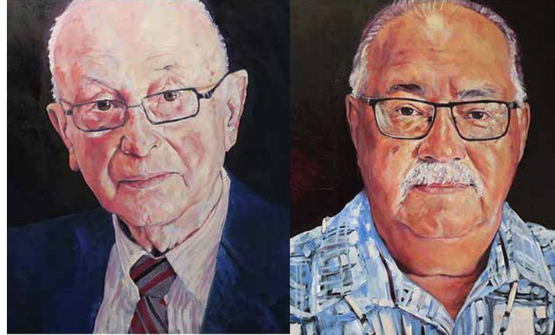
They didn't know we were seeds (November 17 to February 28, 2022)

*Exhibit data overlaps with the Silk, Satin and Strength exhibit.